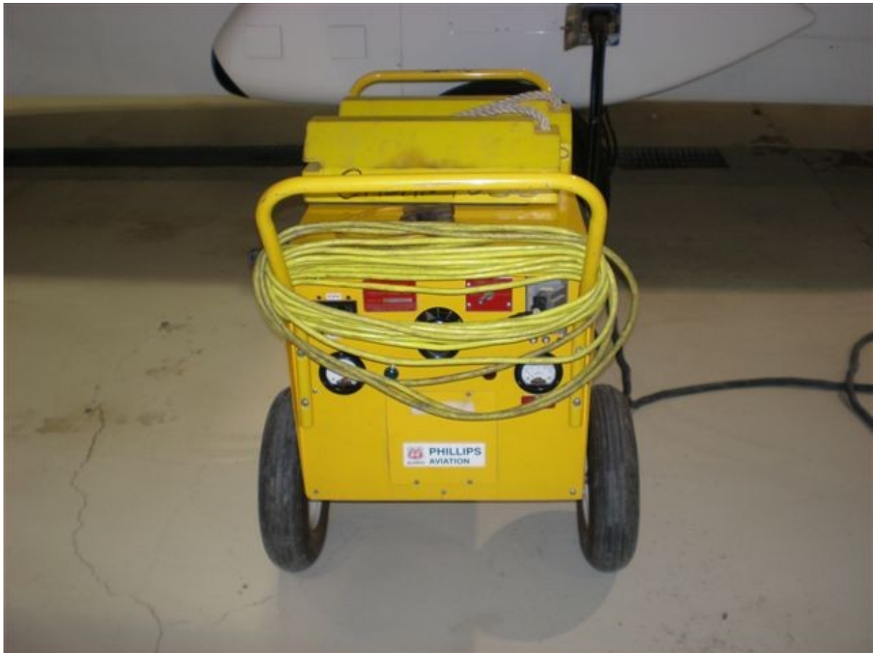
Conoco-Phillips Ground Support Before