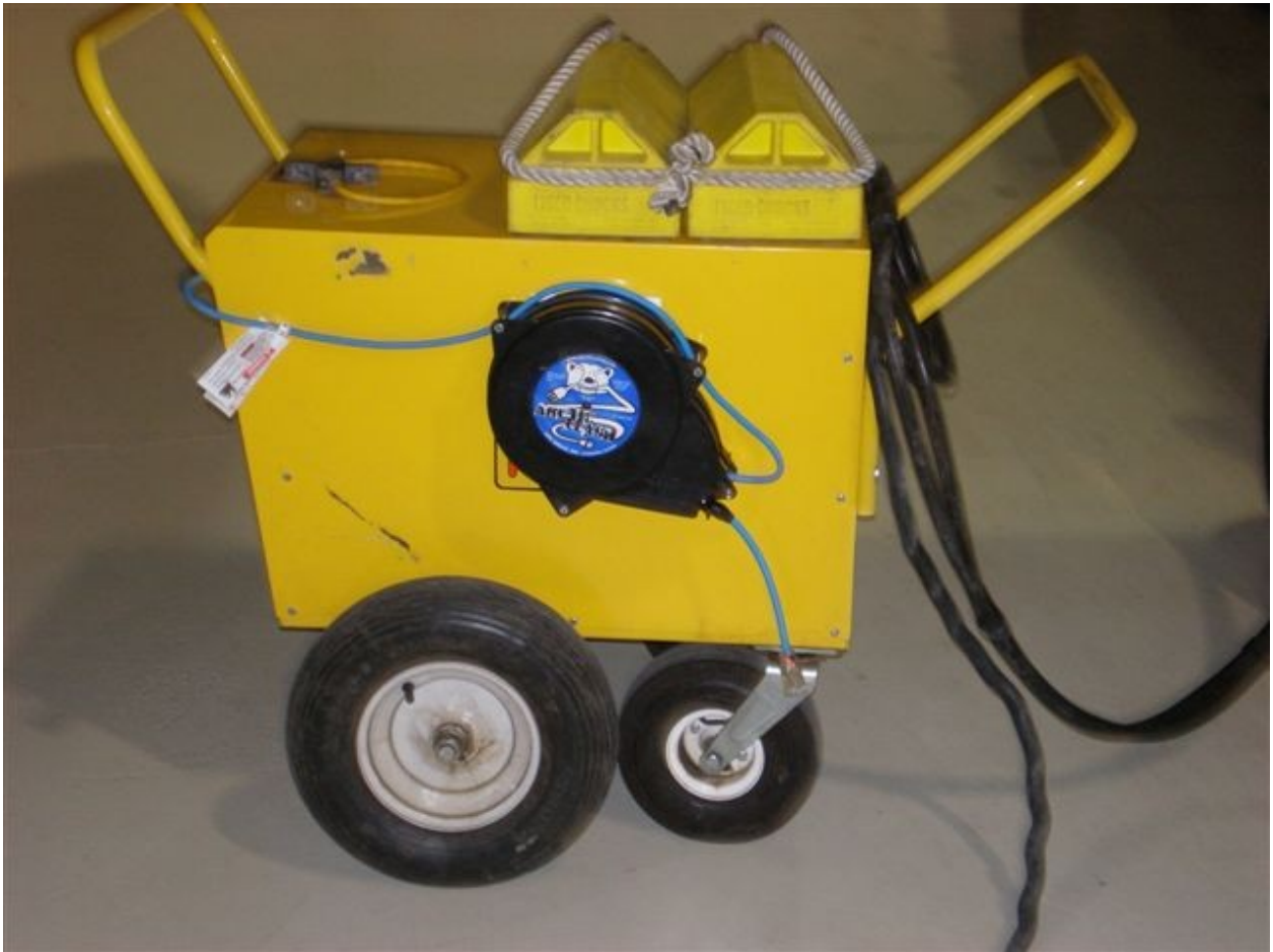
Conoco-Phillips Ground Support After